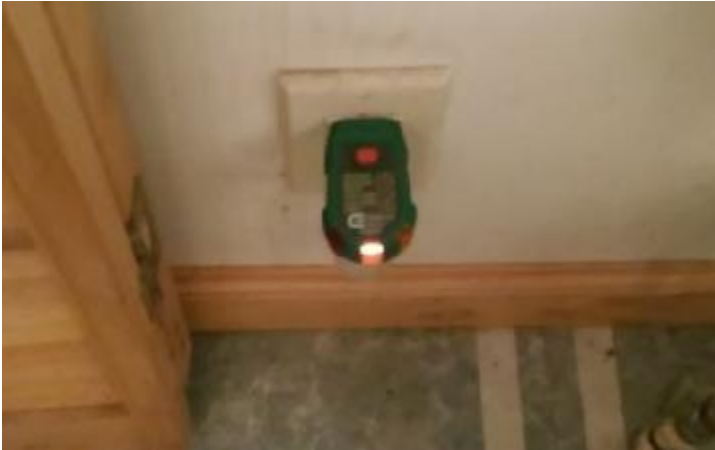
Bathroom outlet has open ground