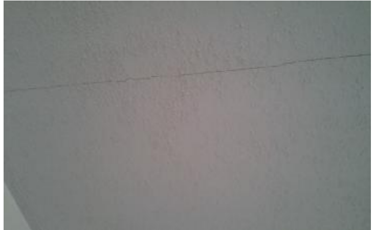
Settlement crack bonus room