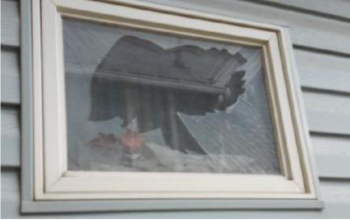
Side window broken