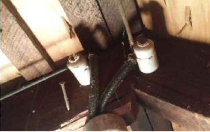
Knob and tube wiring in attic