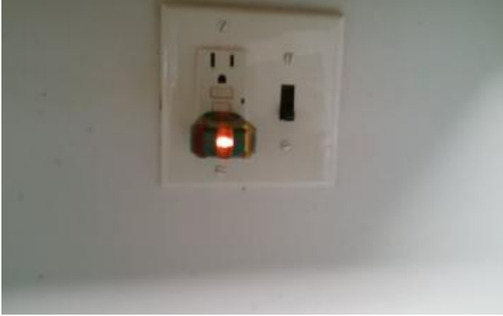
Outlet in kitchen has open ground