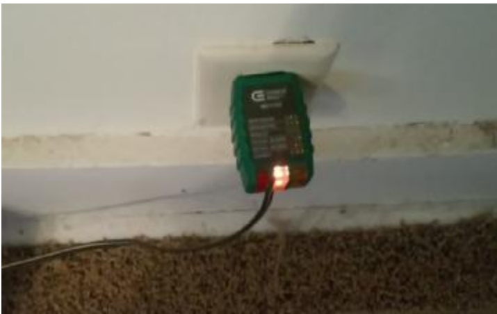
Outlet in bedroom by door has open ground