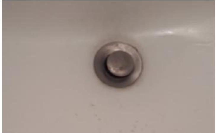
Bathroom sink drain stop not attached