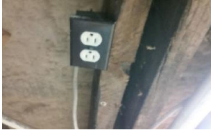
Outlet needs to be GFCI