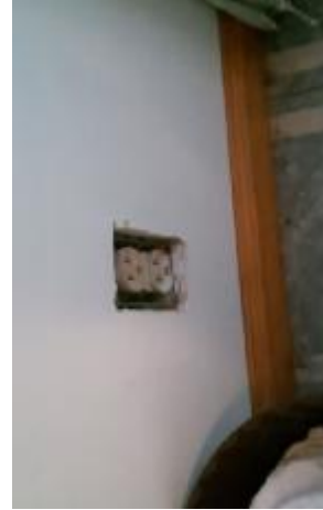
Laundry outlet missing cover