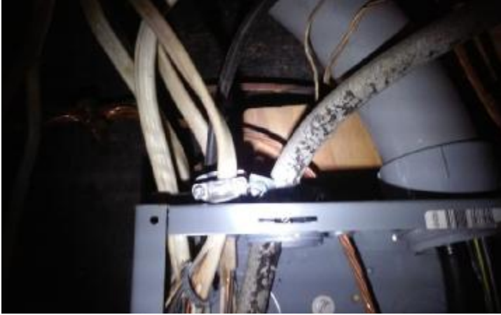
Wire clamps not secured