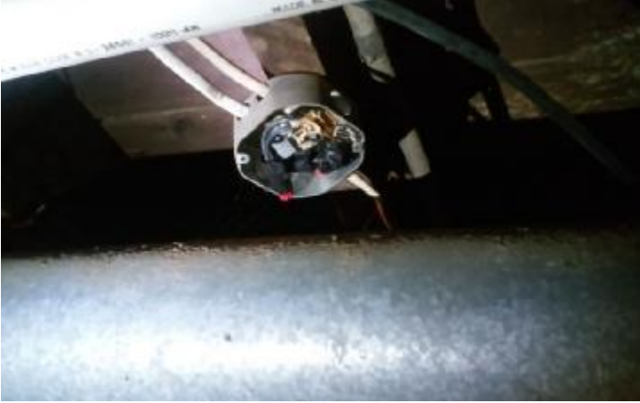
Missing junction box cover