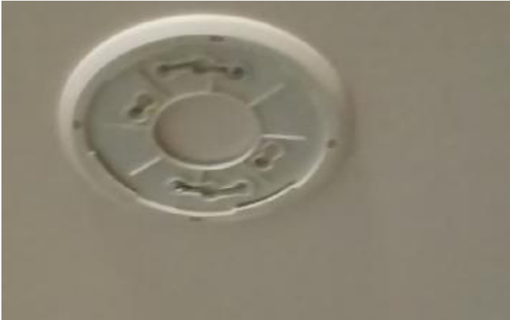
Missing smoke detector