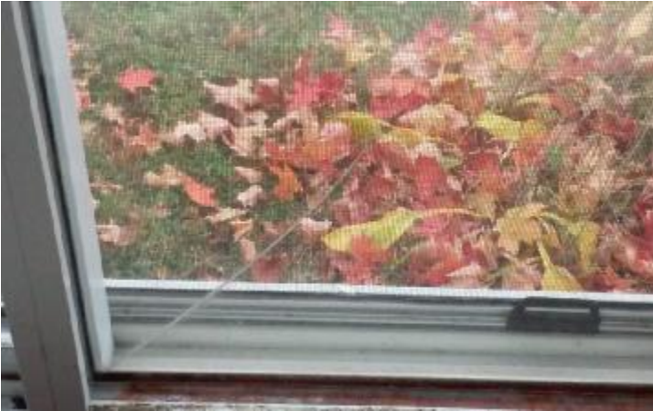
Front of house window cracked