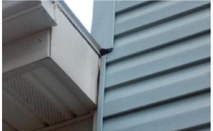
Gap in siding